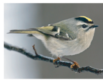
GOLDEN CROWNED KINGLET