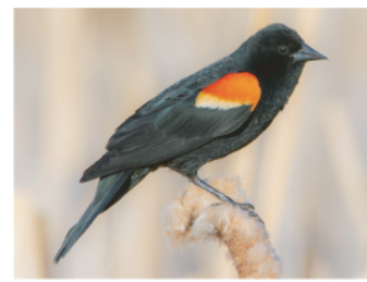
RED WINGED BLACKBIRD