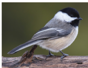
BLACK CAPPED CHICKADEES